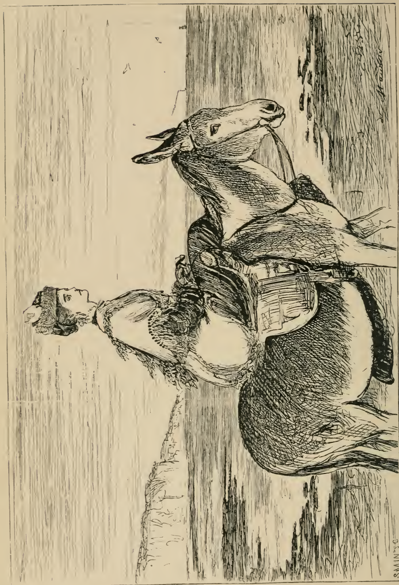
SO ETHELERTA WENT.